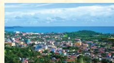
Sihanoukville Port City