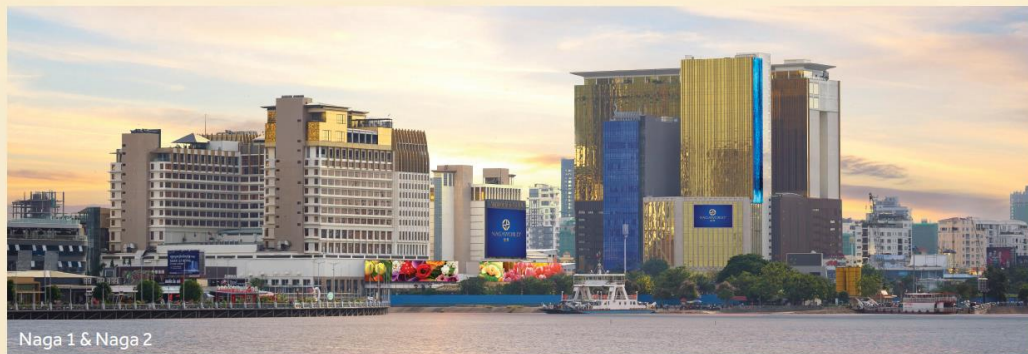
Naga 1 & Naga 2