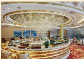
The Vimean-Bar Counter