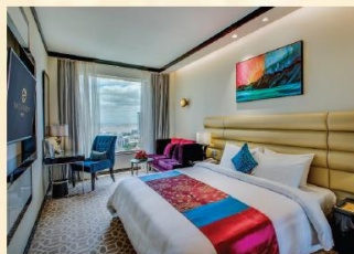
Naga 2 Superior Room